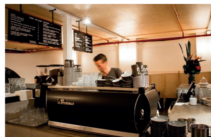
THREE WILLIAMS 613A ELIZABETH STREET, REDFERN

It's a suburb that's constantly evolving, with each street a marriage of community preservation and burgeoning creativity.