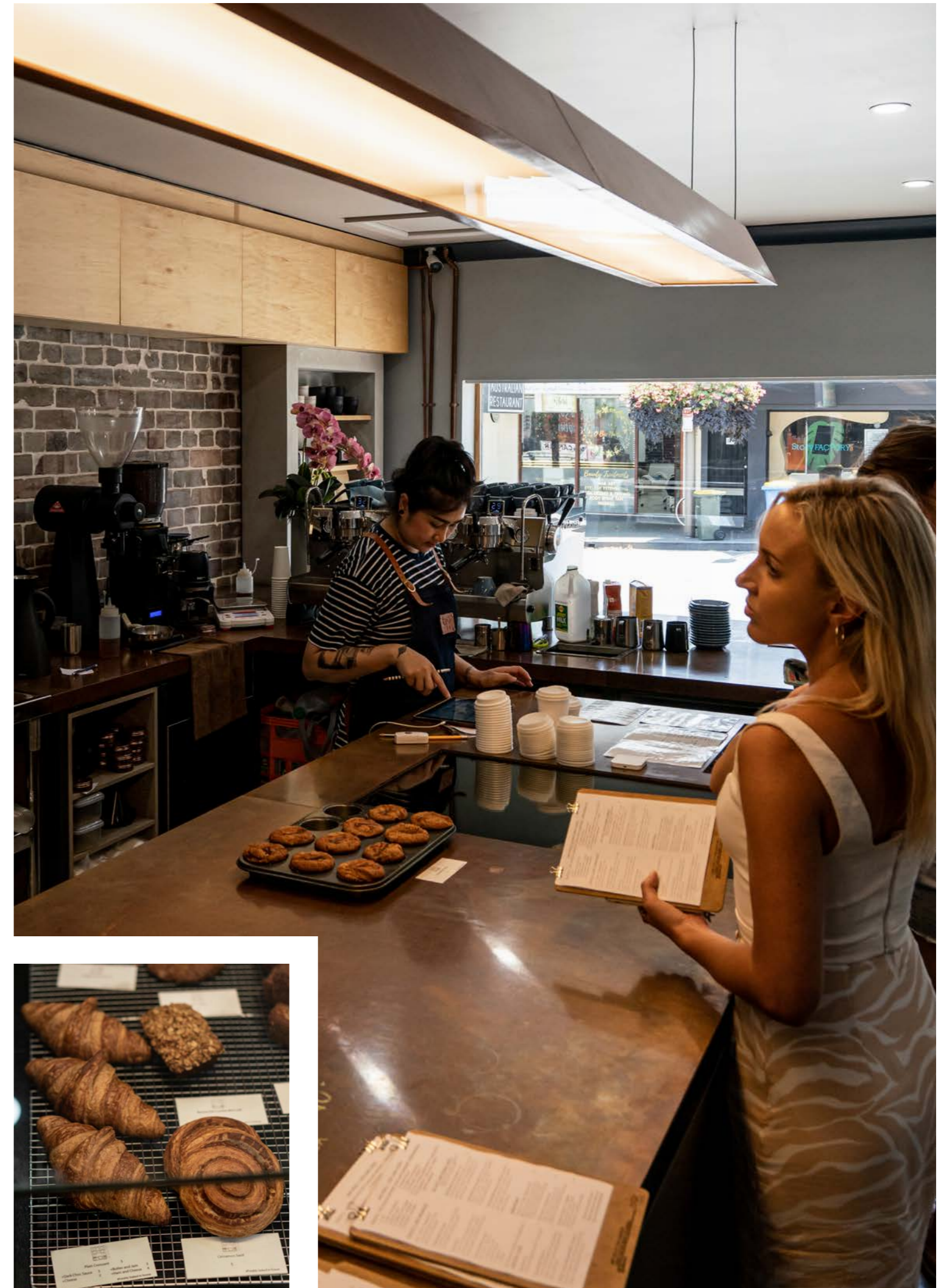
BLOC145 145 REDFERN STREET, REDFERN