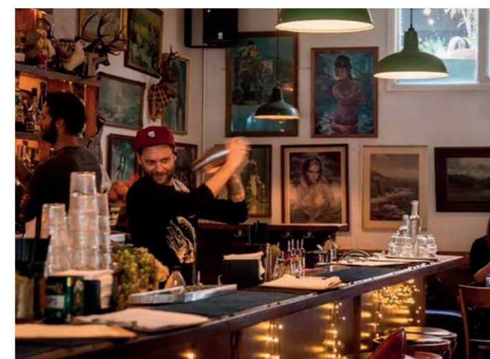
ARCADIA 7 COPE STREET, REDFERN