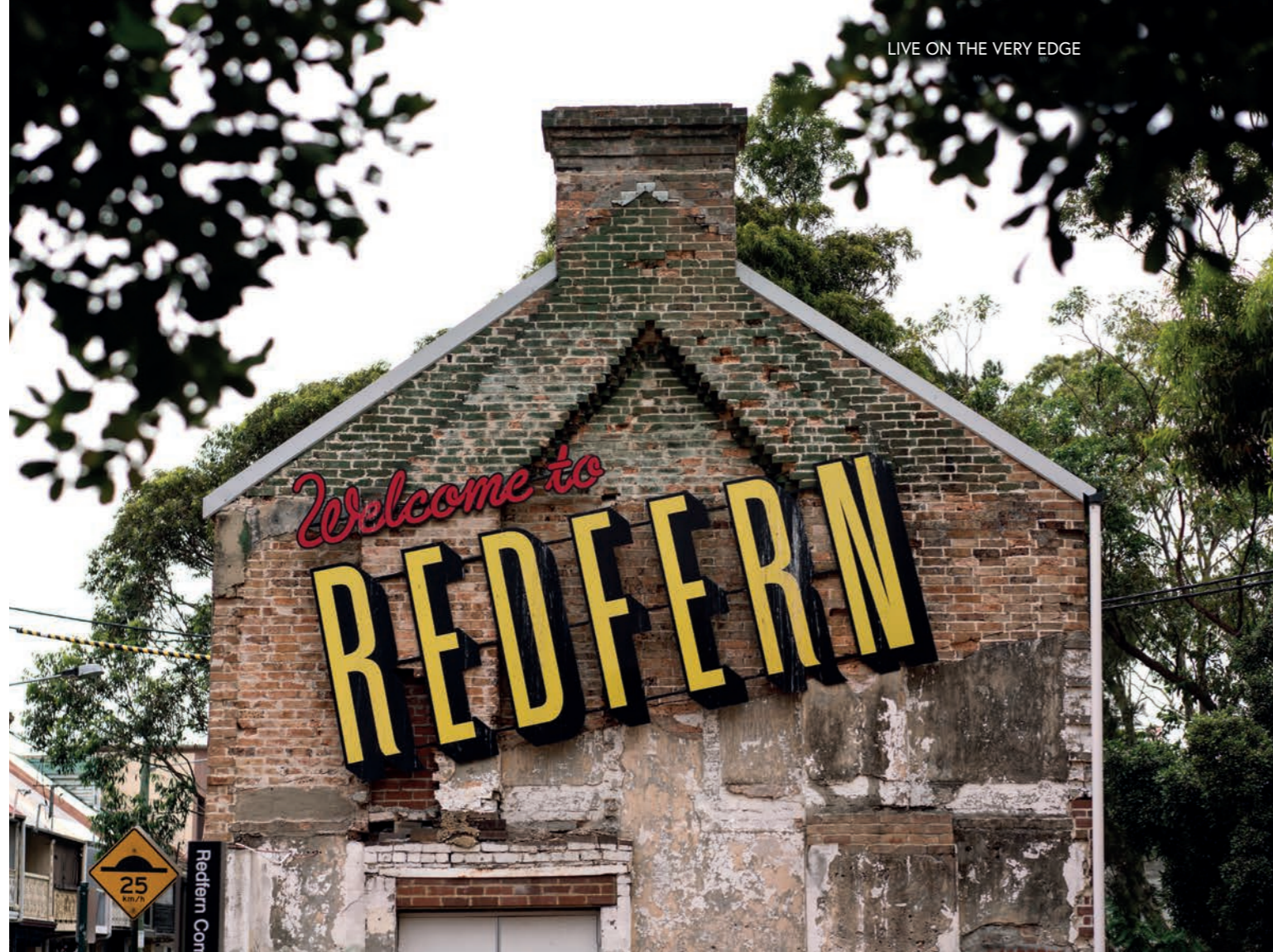
REDFERN COMMUNITY CENTRE PLAYGROUND HUGO STREET, REDFERN