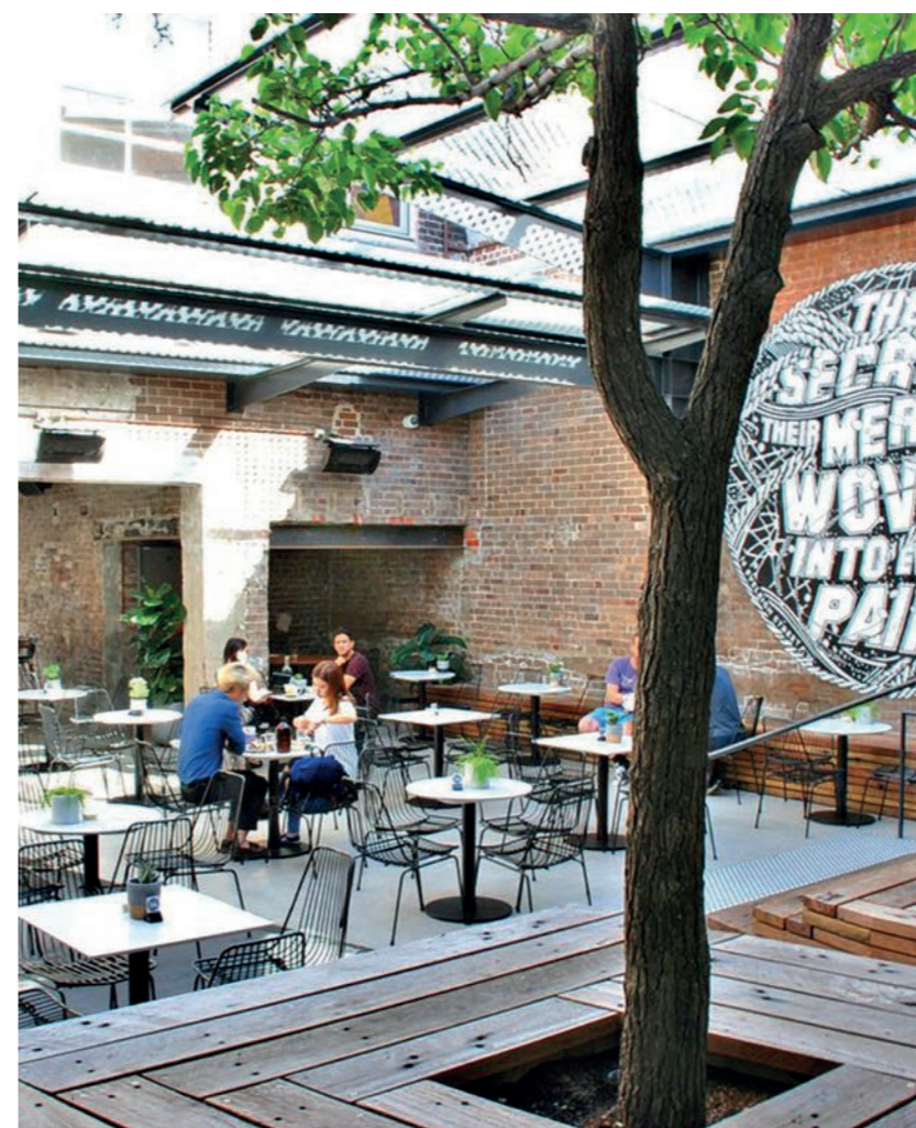
HENRY LEE'S 16 EVELEIGH STREET, REDFERN