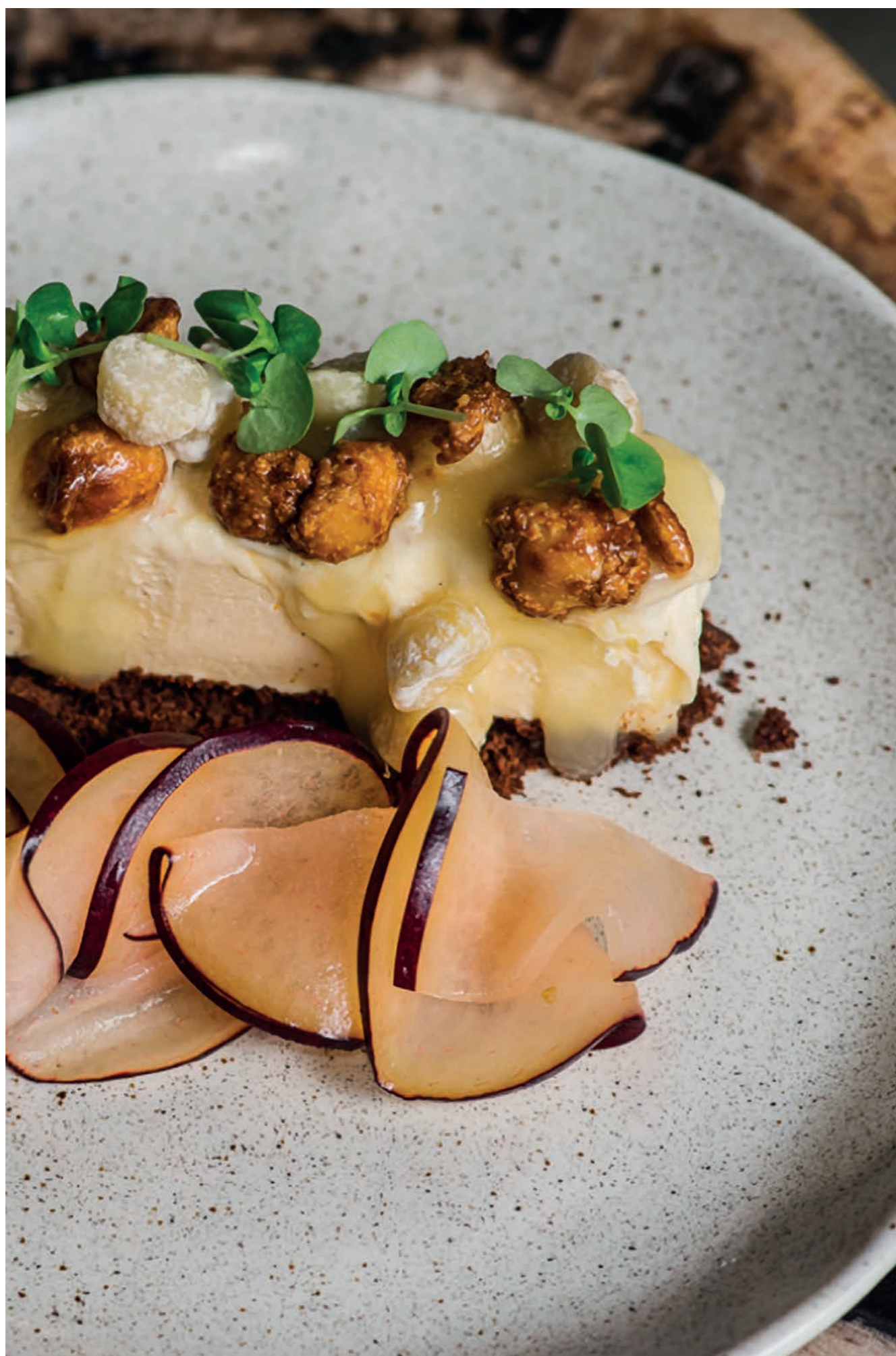
MJØLNER 267 CLEVELAND STREET, REDFERN