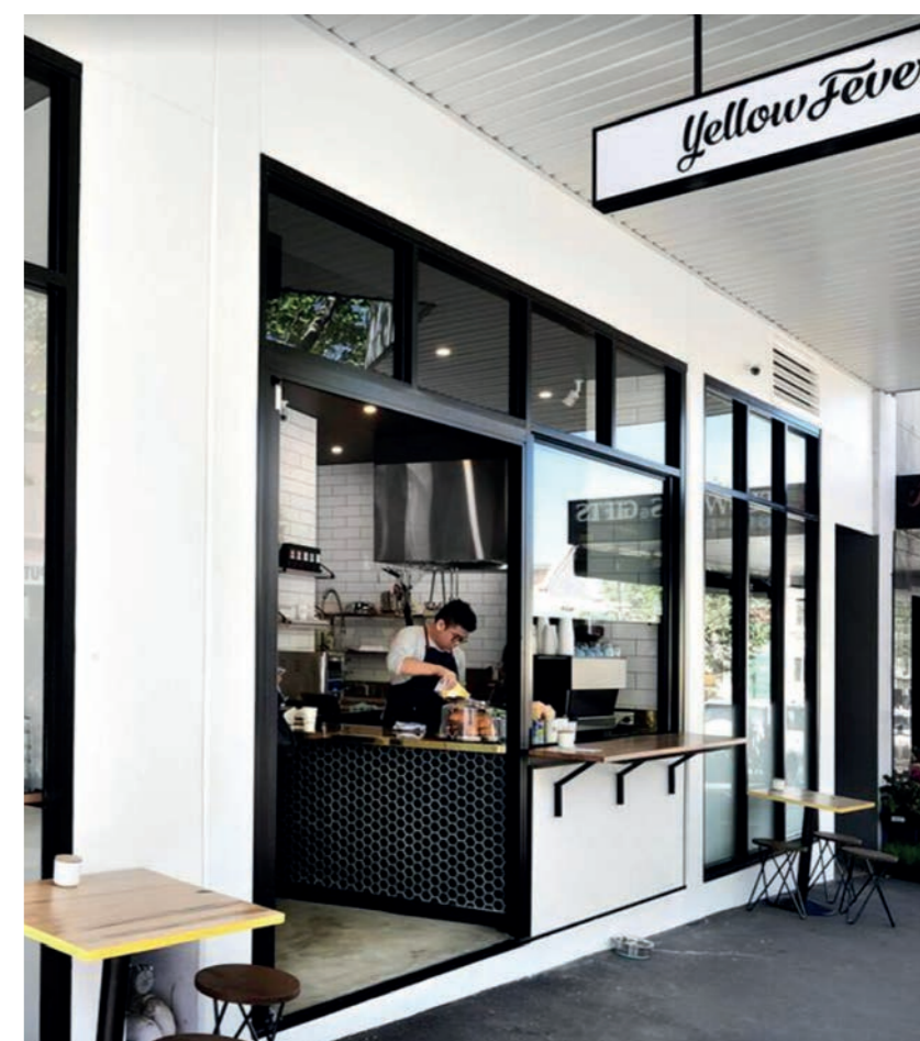
YELLOW FEVER 133 REGENT STREET, REDFERN

It's a suburb that's constantly evolving, with each street a marriage of community preservation and burgeoning creativity.