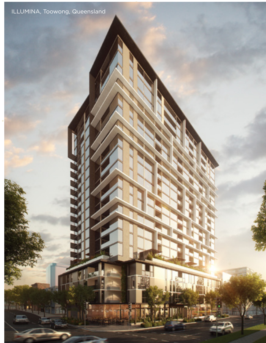
ILLUMINA, Toowong, Queensland

CWG International is one of the most awarded Property Developers in China and has delivered high quality large scale projects surpassing AUD$1.5 Billion in project value consisting of schools, commercial buildings, business parks and luxury residential apartments. CWG International currently has AUD$1.6 Billion in the pipeline in China.