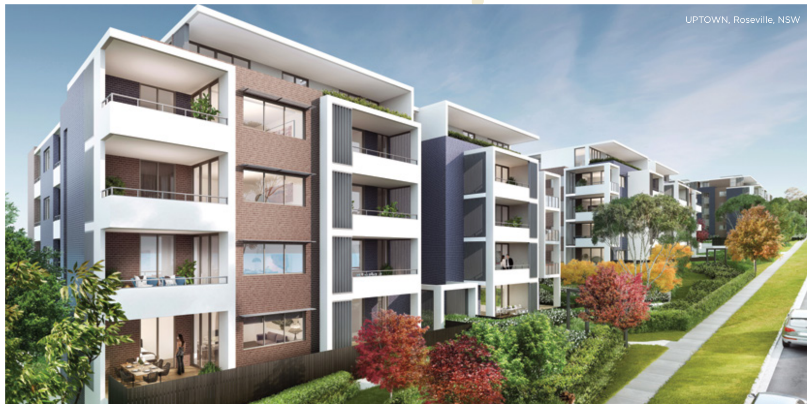
UPTOWN, Roseville, NSW