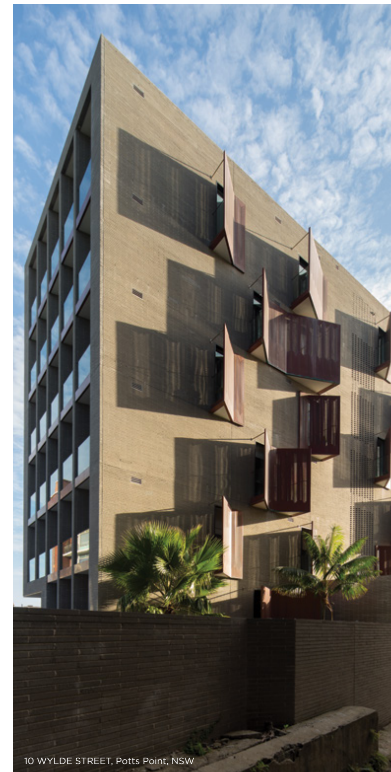
10 WYLDE STREET, Potts Point, NSW

SJB has received a record 45 awards in Australia and internationally for design excellence between 2012-2017.