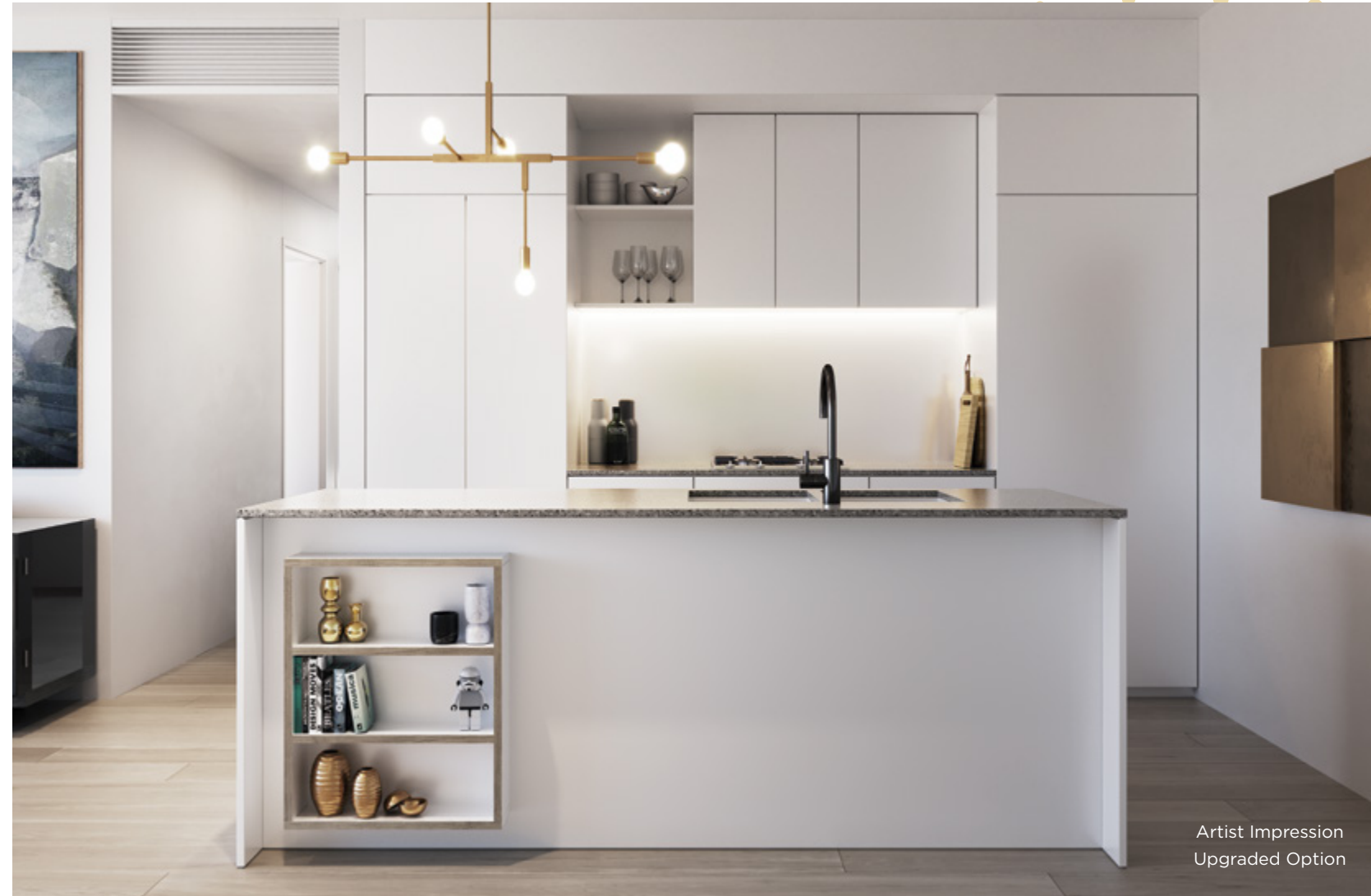
Artist Impression Upgraded Option

Chic modern kitchens feature ample storage and island benches, designed for efficiency and effortless workflow.