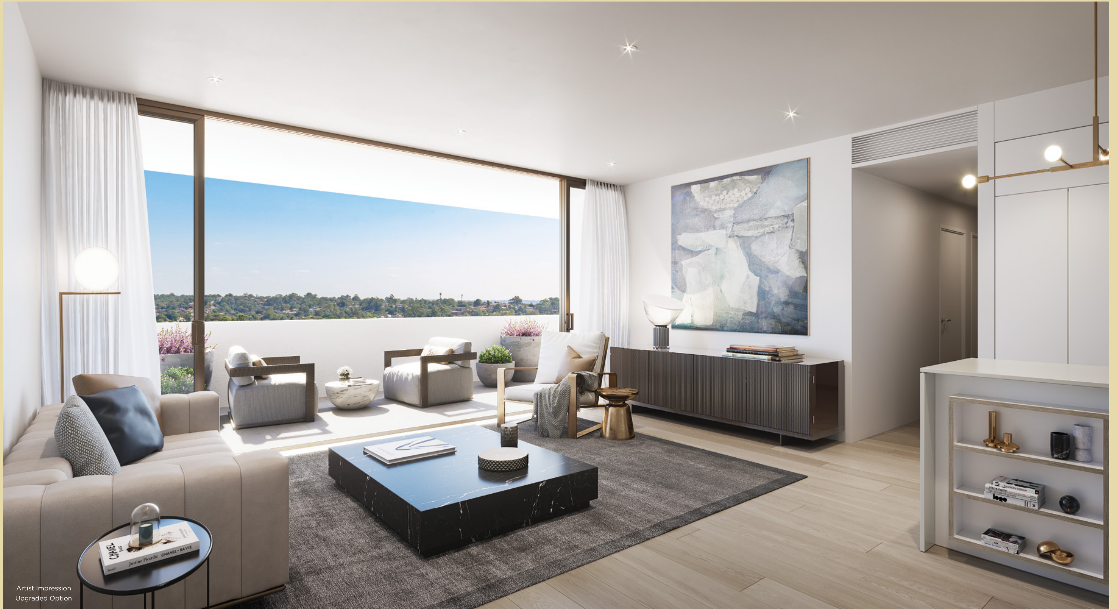
Artist Impression Upgraded Option

Opt for quality carpet in living areas or upgrade to timber floors – the choice is yours.