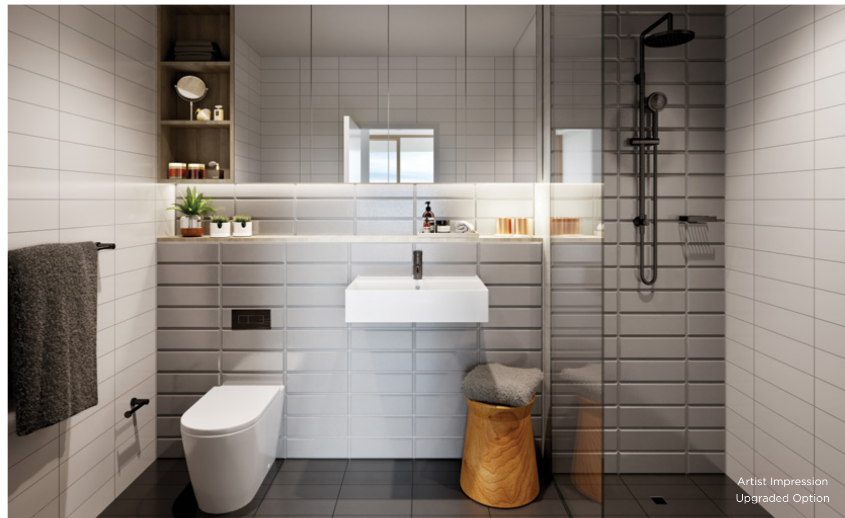
Artist Impression Upgraded Option

Bathrooms are elegant and contemporary, with classic white surfaces and sleek minimalist appeal.