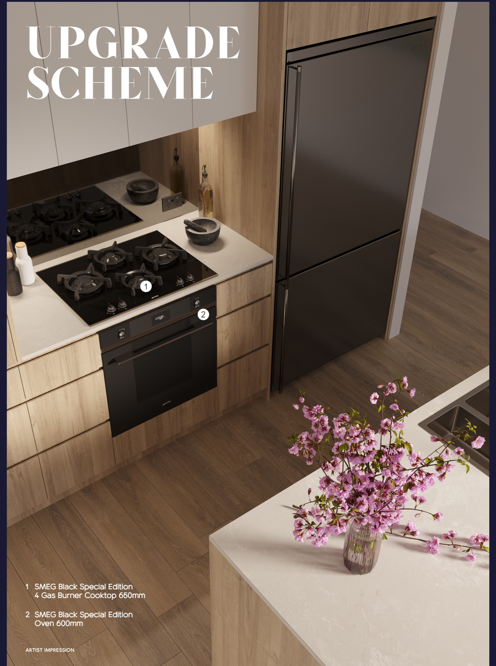
1 SMEG Black Special Edition 4 Gas Burner Cooktop 650mm