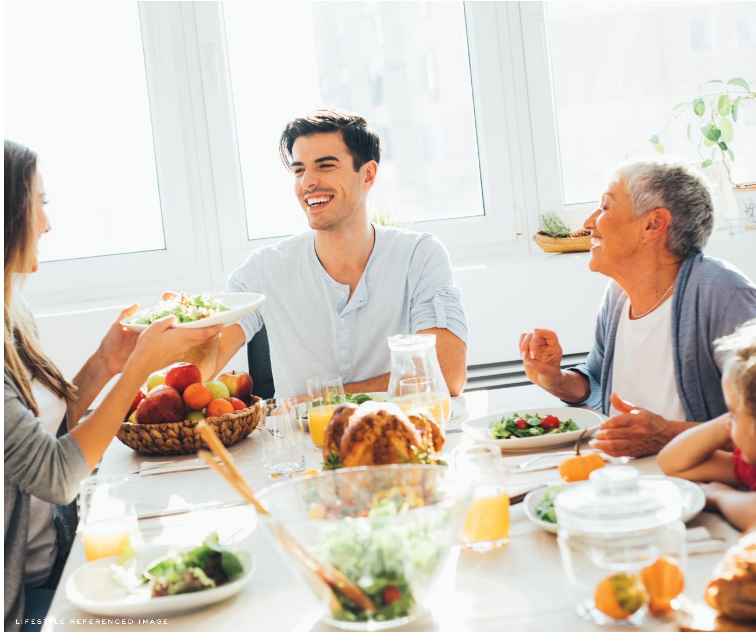
LIFESTYLE REFERENCED IMAGE

Right from the first impression, Summit is a residence of quality and distinction. Bold artistic touches that recall a fine hotel create a feeling of occasion in your everyday routine and remind you that home is a place of rare delight. Security entrances and careful design give you safety and privacy. Within that haven, you'll feel confident living life in the open, making the most of common areas including a beautifully landscaped courtyard of organic curves, with relaxing foliage everywhere you look.