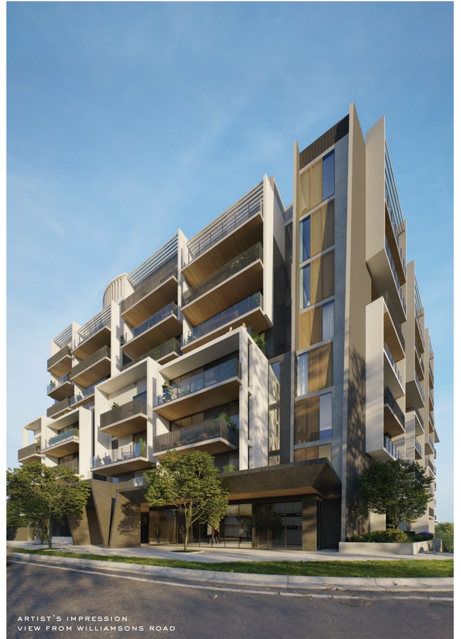
ARTIST'S IMPRESSION VIEW FROM WILLIAMSONS ROAD

Its design captures an innate sense of height and ambition, softened by varied forms, the natural warmth and texture of wood, and a cushion of greenery that extends into the shared courtyard. Look out over the trees to the city from the communal gardens on both the elevated ground floor and eighth-floor rooftop, and appreciate how far you've come.