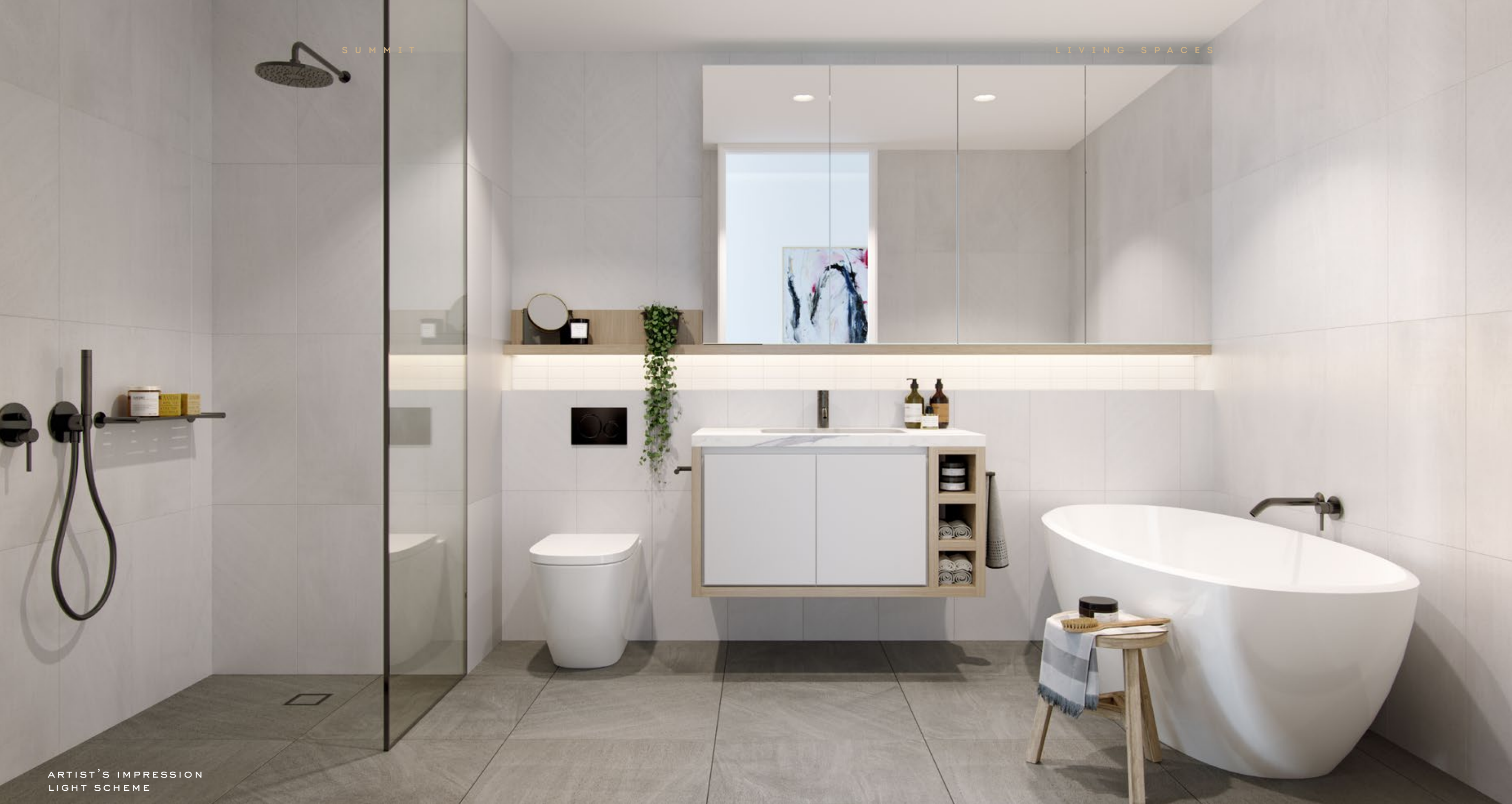
ARTIST'S IMPRESSION LIGHT SCHEME

WAKE UP AND GET READY TO LIVE YOUR DREAMS