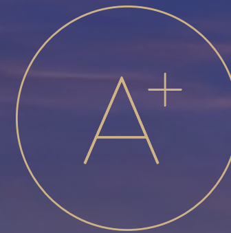
QUALITY DESIGN & FINISH