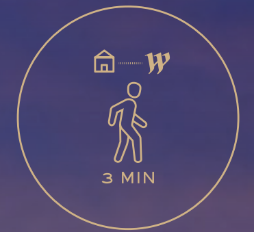
SHOPPING & CONVENIENCE